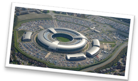
GCHQ Cheltenham Aerial Image 2014

material from the British intelligence agencies, up to around 1989. I have complete access to GCHQ records on the matters which I am addressing, and none whatsoever to those which we have agreed that GCHQ will not help me to cover. I also have access to related files